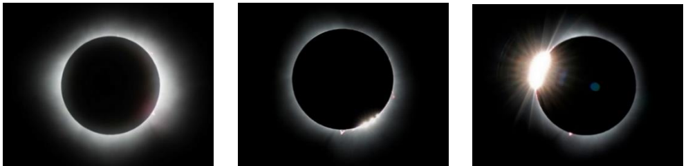
Figure 5: Eclipse views taken at the Valley Hills site.

So, despite all odds, another successful eclipse. The shade temperature chart demonstrates well the effect of the variable cloud cover between C1 and C2, as does the critical or vertical luminance graph. Comparing the latter graph to that of Exmouth last year, it can be seen clearly that this eclipse was the darker of the two at totality (1.98 kLux compared to 23.38 kLux last year). This peak darkness level may well become the prime area of research for the next few eclipses.