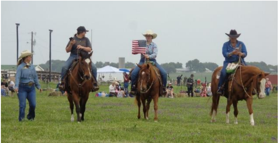
Figure 4: The Equestrian Centre Owners

Off to the Equestrian Centre in the area of Valley Mills, just outside Waco, a little nearer to the centre eclipse line. The clouds were reasonably broken when we arrived. We were very early, anticipating major traffic snarls, but of course there was hardly any other traffic. The site was well laid out. We had several acres for our sole use, there being about 150 off us. There were portaloos and a stall selling food and drink and even the occasional T-shirt. The owners toured round greeting us on horseback (of course!), carrying a US flag for some reason.